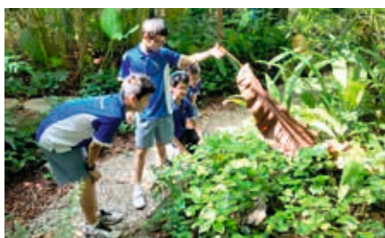
Engage in environmental investigative work

opportunity to study our school's Rainforest up-close. They are encouraged to ask questions based on their observations of the structure of the rainforest, the characteristics of the plant life and the ways in which the plants have adapted themselves to the tropical climate.