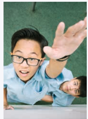
Supporting others in reaching greater heights