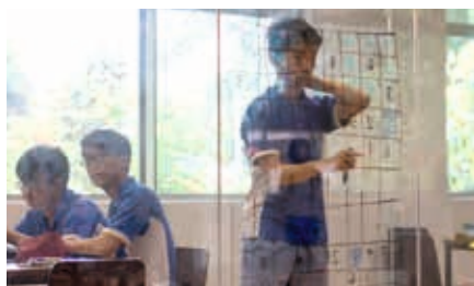
12 Grimmauld Place - a great hangout for collaborative work

With the aims of rejuvenating the library and strengthening the reading culture in the school, the Library Committee adopted the school's design protocol, Design Thinking, which places the users' needs at the forefront, to reimagine what the library could and should look like. The committee conducted rounds of interviews, observation, rigorous ideation and testing with the students. The end result was a library designed for everyone, serving different needs.