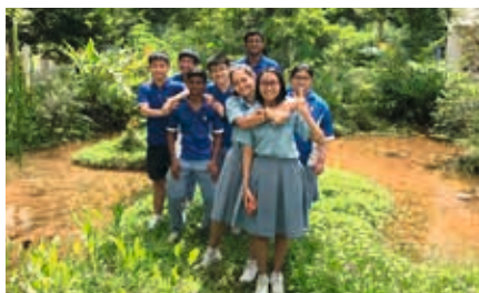
Enjoying the rich biodiversity of our Wetlands