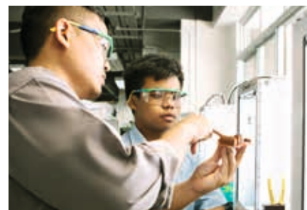
Learning 3D printing from our maker coach

get to work in teams to identify complex problems, understand the needs of those around them, and follow up with prototyping and testing their innovative solutions.