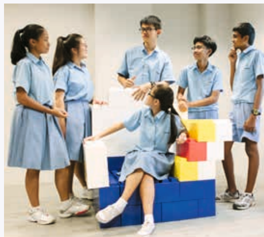
Listen with empathy

We recognise that leadership is not a matter of power and authority. With confidence and compassion, our student leaders are well-positioned to make the world a better place.