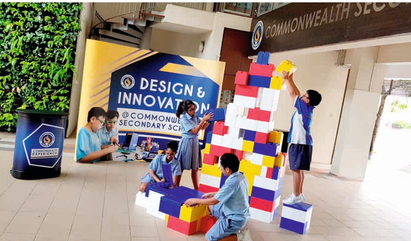
Nurturing creativity through unstructured play