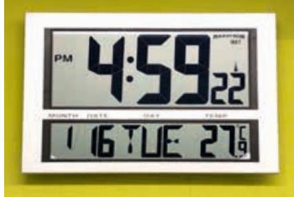
With a sense of responsibility and the timekeeper, having no bell is not an issue

Bells were used since the Industrial Age as shepherds to move people to their next task. The time has come for us to progress beyond being just followers. Since 2015, CWSS did away with the school bell to enable students to build their own “sixth sense” of time telling. In its place, we use GPS synchronised clocks to show us when lessons start and end. This instills a sense of responsibility in our students as they develop important self-management skills. In some cases, students have even become timekeepers for teachers during lessons!