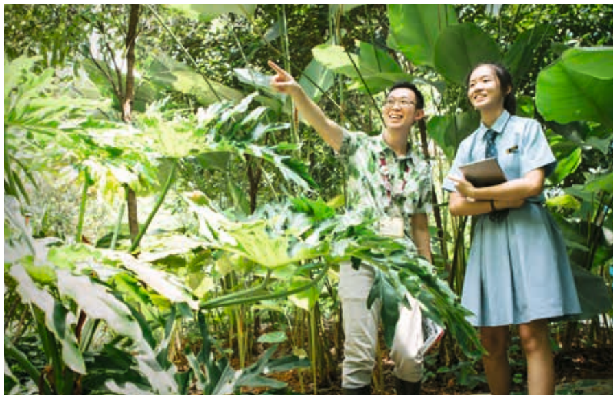
Our Eco-habitats offer learning beyond the confines of the classroom

Our students take their Geography lessons out of the classroom and have a first-hand