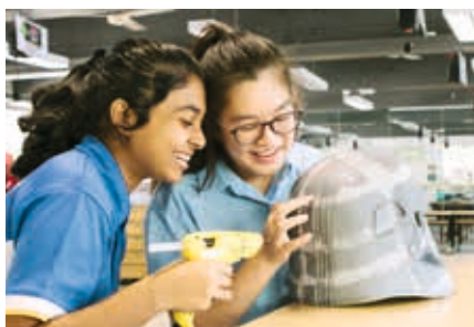
Space for students to imagine and create

Our students also get to put on a designer’s hat through our in-house Design Thinking curriculum where they learn to be human-centric problem solvers. In these classes, they