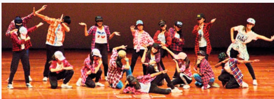
Arts Elective Programme

All these take place in a highly supportive environment with informal teacher mentoring, formalised training and even professional coaching, giving students the confidence to step up to the world stage and share their creativity!